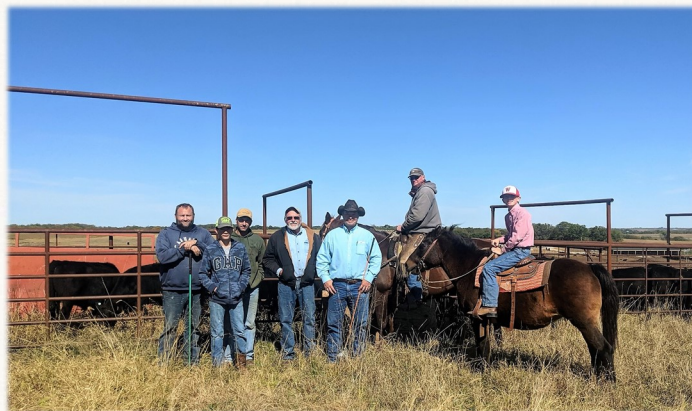
Berges Ranch. Customers for 40 years.

Join us, Friday evening, April 8, for the pre-sale social at the Fink Beef Genetics sale facility. Refreshments, gambling, and visiting.