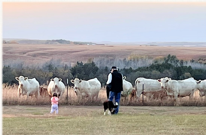
Doesn't get much better than this.

Dam is a Gold Standard x Free Lunch. Redemption is an old proven Red Angus sire that has influence in many commercial and seed-stock herds worldwide.