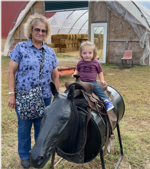
Still likes 4-wheelers the best!