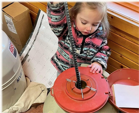
Blowing in the nitrogen tank is exciting with vapors going everywhere!

42 BARRETT 0480A 5300 TR DOB: 08/21/20 Reg#: 20261122 Tattoo: 0480 Paintrock Mountain Man Paintrock Trapper Emulous of Paintrock 93-9 Sitz Dash 10277 Barrett Rita 5300 111 Da BARRETT Rita 111 of 1709 NW