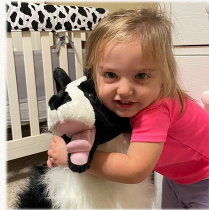
Border Collie Trainer

24 BARRETT 0451G 821 RF DOB: 09/18/20 Reg#: 20296361 Tattoo: 0451 Coleman Charlo 0256 S A V Rainfall 6846 S A V Blackcap May 4136 N BAR Emulation EXT A1747 BARRETT Rita 821 649 A1747 BARRETT Rita 649 439 PW