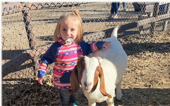
Better to get it out of their system when they are young!

Set of older cows that you would like to get a little more 'jump' from? We have customers that use white bulls on older, lower-performing cows. The Charolais 'edge' gets a producer those extra pounds.